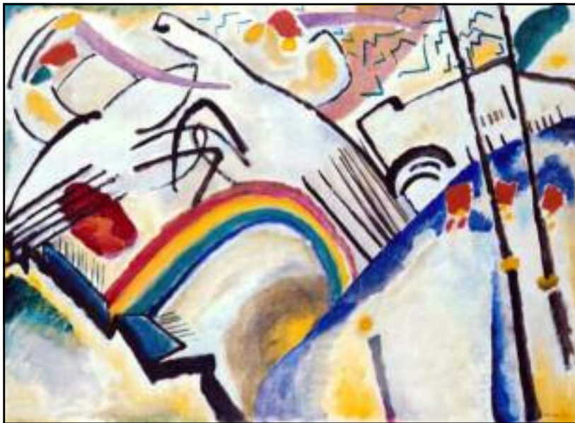
Wassily Kandinsky Cossacks 1910-1911 Oil on canvas 94 x 130 cm