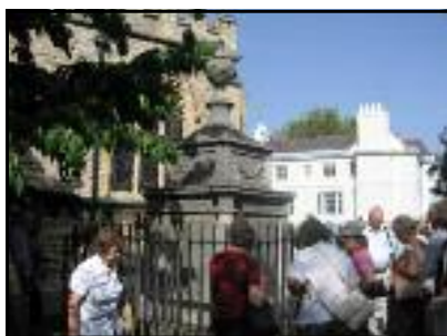
Hogarth's Family Vault in the Church yard at Chiswick

The Museum aims to preserve much of Bushey's past and has an important collection of works from the Munro Circle of the early 19 th Century. It includes many works by Hubert von Herkomer and the Herkomer Art School students. The Museum Trust manages a local study centre and their Education Officers provide imaginative educational activities both at the Museum and at Reveley Lodge for schools. The Museum is situated in Rudolph Road, Bushey Village and is open from 11am – 4pm Thurs Fri Sat Sun.