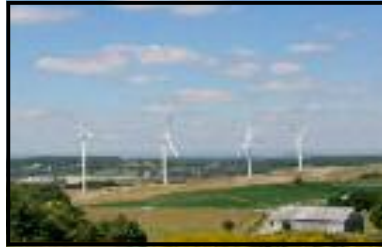
N York Moors Wind Power website

The potential for improvement is enormous. Siting of wind turbines is critical. Power generation depends on the wind speed cubed, so it is vital to build in the windiest spots to obtain the best power output and greatest efficiency.