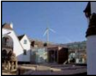
RES Kings Langley MCT