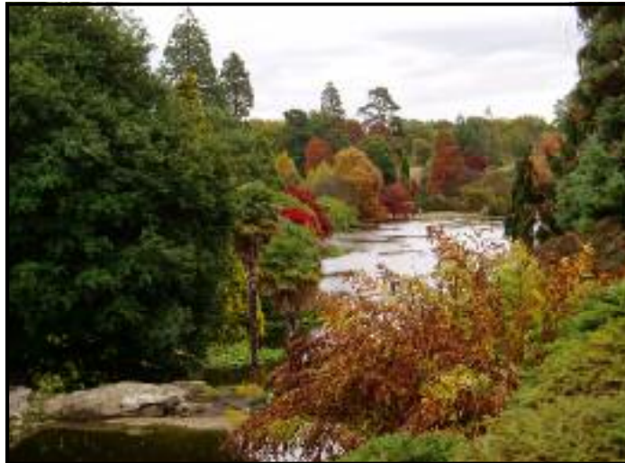
Beautiful early Autumn colours at Sheffield Park.

What a long time ago now, but the jewels still appear with the last of the runner beans and ripe tomatoes to be harvested. I used to start about this time to cut back all the 'finished' perennials but like my father before me I now remember our feathered friends who need winter food and so I leave all the ripening seed heads. I am well