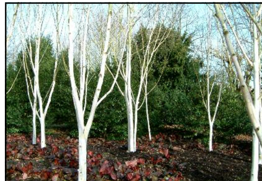
Anglesey Abbey; Silver Birch under planted with Bergenia.

The garden was even more stunning than last time. Of course since it was a lovely day and half term at that, the crowds rolled in and the receptionist said that it was the busiest day they had had since 'the snow-drop walks' began.