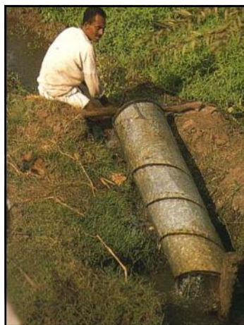
Archimedes Screw photo 'Insight Guide to Egypt'

Iran has very complex systems of boreholes and tunnels to bring water from the mountains to the towns and farms. The system was developed a very long time ago. Oman is profligate in use of water with fountains and gardens using vast quantities. Namibia is vast but supports a very small population due to shortage of water. There is subterranean water with tree tap-roots over 100 feet deep. The five-yearly rains replenish these supplies. Some animals have adapted to the dryness and heat, ground squirrels can live for up to a