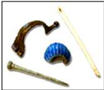
300 year old artefacts found during the excavation of the Roman Villa in 1981.

Georgiana, an enthusiastic Whig supporter, realised it was time to try to unite the various Whig factions into a viable and coherent Opposition to Addington and the King's party. She worked for two years at this goal. Pitt and the leading Whig, Charles Fox, had been at odds with each other for some time. Fox desired not only Catholic emancipation, but Parliamentary reform and an end to Britain's participation in the slave trade. In March 1802, Addington managed to secure peace with France, and Britons were again able to travel in France, until Napoleon invaded Malta, at which Britain declared war, as a consequence of which, Britons in France were held as prisoners of war. In the midst of all her political activities Georgiana became ill with kidney stones, the only treatment for which was bleeding and Laudanum. However, she recovered and Fox asked her to be his Whip. When there was a Crucial vote in the Commons, she would arrange for her coach to take lackadaisical MPs to the House. (to be cont.)