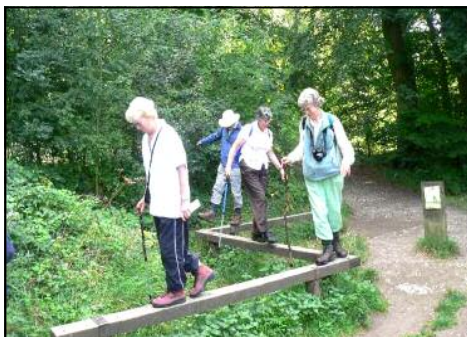
Intrepid Explorers Zig Zag Walk

Wendover Woods are very popular with local people. There were many mums with small children, and dog walkers. It has good car parking and toilets.