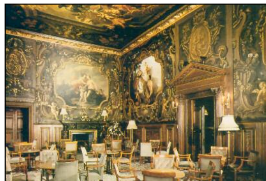
Moor Park Mansion The Thornhill Room. Paintings depict spring and summer. Ceiling by Verrio.

The entrance hall, decorated with paintings by Amigoni, leads into the preserved saloon with paintings of the "Four Seasons" lining the walls. A dome was