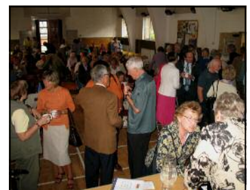
A Lively Buzz of Enthusiasm