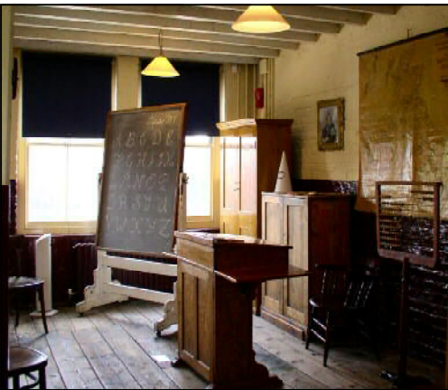
Ragged School Museum

OUR September Outing was to the Ragged School Museum at the end of the Mile End Road, and to The Museum of Childhood in