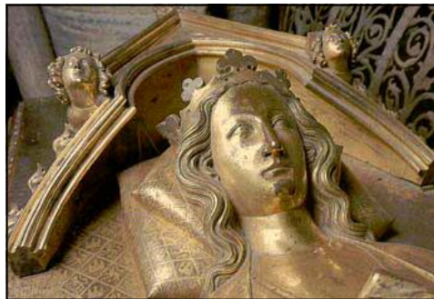
Eleanor's Tomb in Westminster Abbey.

Westminster Abbey. Wherever her body rested overnight, he had a stone cross erected, the best known being at Charing Cross.