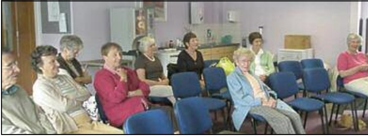
The History Group