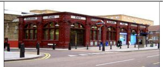
Red tiled Kilburn Park underground station designed by Stanley Heaps.