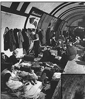
London Underground station being used as an air-raid shelter and The 'Cross Over, Old Holborn' [R].

The course traces the development of the early smoke filled lines and the how and why of their creation, and what it was like to travel on them. It also explores how the idea of a copy writer gave birth to the cultural phenomenon of 'Metroland', and how, improbably, the Underground became the greatest example of good industrial and commercial design this country has ever produced. Not just for train enthusiasts, but be warned, occasionally there will be pictures of trains.