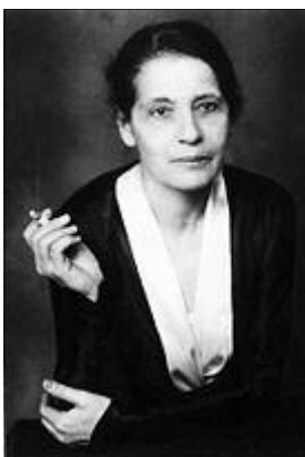
Lisa Meitner ca. 1928

IN the early 1920s, physicists would gather at the Kaiser Wilhelm Institute in Berlin, to hear lectures by those already famous. At one of these gatherings where Einstein was the lecturer, suddenly the voice of a young, unknown man was heard. "Dr. Einstein, you have made a mistake!" A breath of disbelief spread through the audience. Einstein walked up the central aisle, looked at all his mathematical calculations on the board. "Yes you are right" he said after a long pause. That was his character to be able to accept criticism.