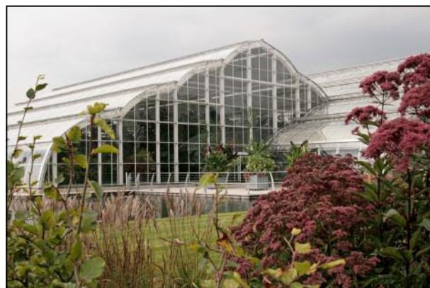
The fantastic New Tropical Conservatory at Wisley.

WISLEY in North Surrey is the premier place for gardeners and has something for everyone at any time of year. Our planned visit was always going to be enjoyable but we benefited also from a gloriously warm and sunny day of the kind rarely seen this summer. Everywhere was colourful with beautiful dahlias and asters in particular providing strong contrast to grasses, shrubs and well-kept lawns. Those who visited the glasshouse now thoroughly established in its surroundings declared it magnificent. The new