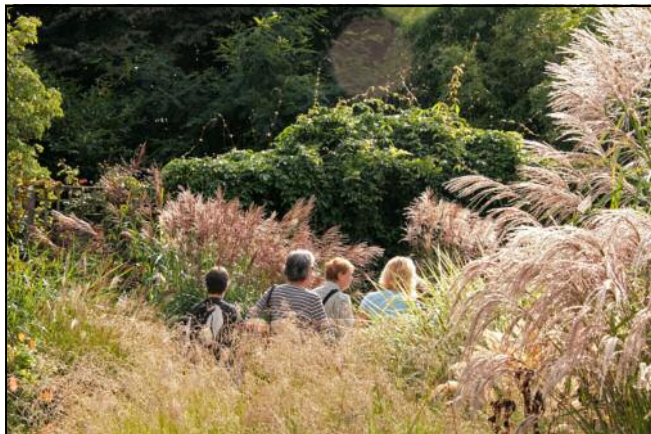
Last seen - heading west!?! (Ed.)

planting inside has developed superbly and was about to have its annual 'service'. Surrey Sculpture Society members were displaying a large number of varied items around the grounds which added to the interest as we walked and there were plenty of opportunities just to sit and enjoy the sunshine. For most people the visit was rounded off by a tour of either the extensive plant centre or the shop before a very easy ride home.