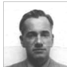
Otto Robert Frisch

Her story is a thriller. As a Jewess she had to leave Berlin surreptitiously and so fled to Copenhagen, where she worked with Neils Bohr for a time. As life became more dangerous Bohr arranged for a boat one night to take her to Sweden where she lived all through the war. She then came to Cambridge where her favourite nephew, Professor Otto Frisch was a physicist. He came to talk to my 6th form and gave a most interesting lecture, not always understood by us so I asked him to 'come down a little'. He was a delightful man always wanting to explain physics to the young.