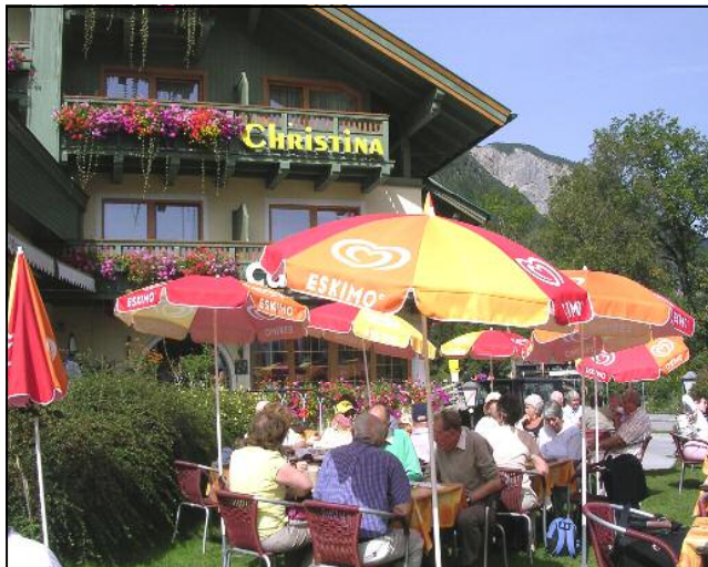
Delicious lunch before our boat trip on the Achensee. JP

AT 4.30a.m. on Sunday 7 th September forty nine members emerged from the gloom and rain at the Essex Arms to load luggage on to the coach for Heathrow Terminal Five. After an uneventful journey we arrived at Munich airport to be greeted by Ingrid, our cheerful, loquacious and knowledgeable guide, who took us to Kirchberg for our week in the Austrian Tyrol**.