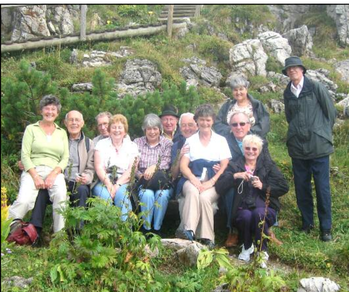
In the Alpine Garden on the Kitzbuhelhorn

We were very lucky with weather. The first few days were well nigh perfect, which showed off the mountains and the beautiful flower bedecked houses to great advantage. We did have torrential rain on three evenings, one a humdinger of a thunder storm. Towards the end of our stay it was cooler but still comfortable. Snow was forecast for a couple of days after our departure.