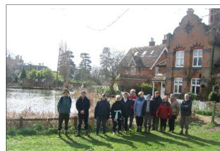
March found them in glorious sunshine on Stanmore Common

Meet 9.45am start at 10.00am. Walks of about