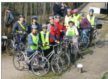
Grand Union towpath near Black Jack's Mill