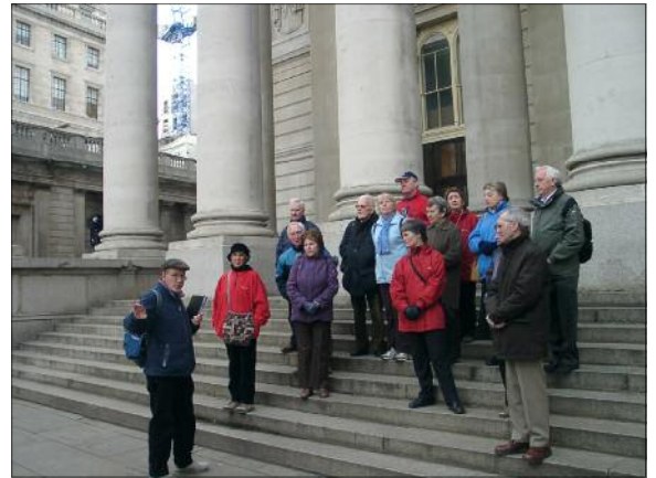
Outside the Royal Exchange at the end of the walk