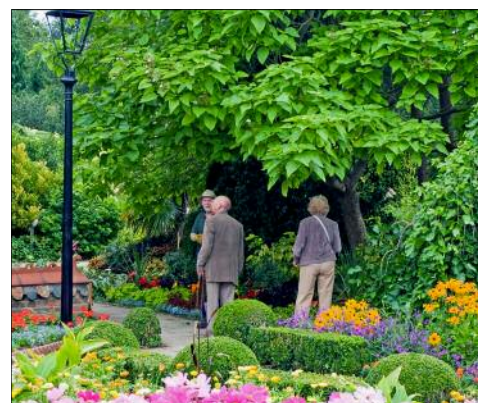
Stockwood Park

There was a lot to see including a carriage collection and a fascinating Art exhibition entitled "Chou Fleur" in which shoes were constructed in paintings by imaginative and rather strange use of flowers and leaves. Everyone then enjoyed a leisurely cream tea to complete a relaxing afternoon.