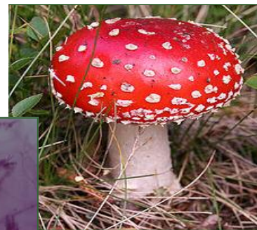
L Penicillium & above Fly Algaric ..

ROSEMARY HOPEWELL is an expert on Fungi and gave us a most interesting and comprehensive talk on edible mushrooms, magic mushrooms and poisonous mushrooms including a list of victims of death by mushroom poisoning over the centuries! Her photos were amazing as she had pictures from all over Europe and they showed great detail of colour and shape. Fungi come in all sizes from microscopic ones that grow in the fuel pipes of jet planes to large brackets growing on trees, and if a fungal system is taken as one organism, they can be very widespread indeed, covering many square metres in area. Alexander Fleming's discovery of the fungus penicillin has saved many lives and he and his team were awarded a Noble Prize for their work in isolating the potent antibiotics.