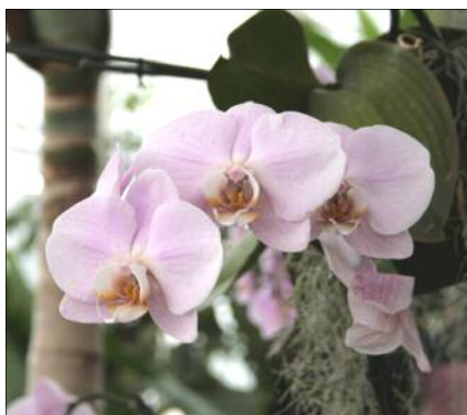
Orchids at RHS Wisley.