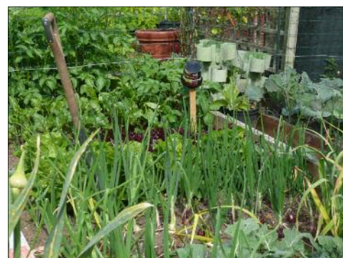
Salad Days in my garden

But still we gardeners labour, midst vegetables and flowers, And pray what hits our neighbours, will somehow bypass ours.