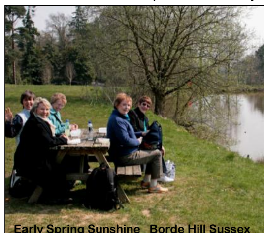
Early Spring Sunshine Borde Hill Sussex

THERE can't have been many people who didn't notice how their gardens woke up in April after such a long and harsh winter! Everything seemed to happen at once. The beautiful sunny days encouraged growth from many plants that we thought had given up although some have inevitably been lost. When our group went off to Borde Hill Gardens in Sussex in mid-April we had a lovely bright day with a chilly breeze. The