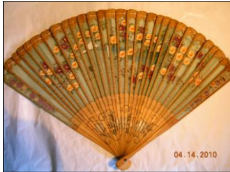
19C decorated silk & wood framed fan.