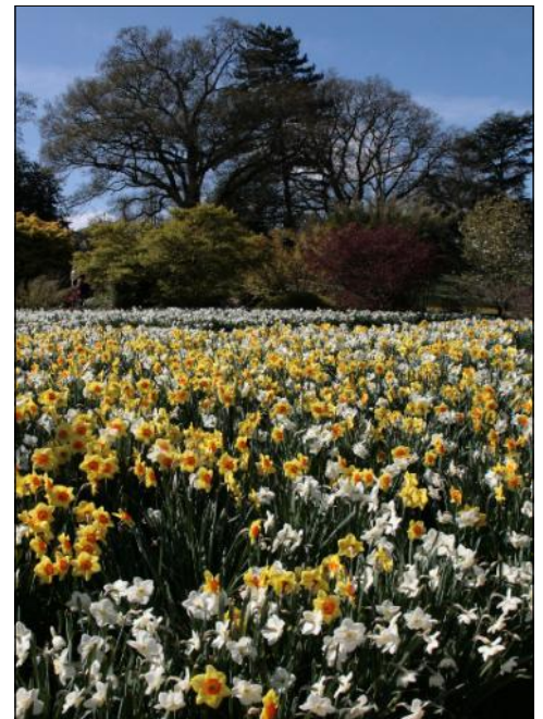
RHS Wisley in the Spring

Report 7/04/10, APRIL 1st.! There I was expecting to be the prime April fool, it being right on two religious holidays but no we had a very good turnout albeit not quite as large as usual. (20 of us). We discussed a wide and varied group of subjects and heard fresh experiences relating to financial and care problems. The news that certain £20 notes would become illegal as from 30 June this year was explained in detail - Notes with the picture of Elgar on the reverse side will no longer be acceptable. After 30th. June they can be exchanged at banks but be warned some of them may make a charge for exchanging them, The only place you can be sure of a straight swap is at the Bank of England - if you happen to be passing their front door in the City! One thing you must watch out for is someone offering you the 'Elgar' notes AFTER the 30th, June. The typical scam will be someone asking you if you can change a £20 pound note for smaller change (for a parking meter perhaps). Have a nice month, don't get conned. See you at the June meeting.