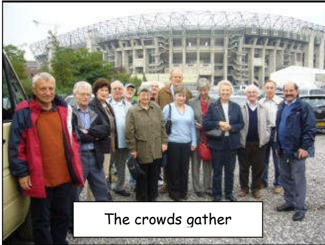
The crowds gather

The October meeting of the Sporting Forum Study Group took the form of a visit to the home of English Rugby, Twickenham.