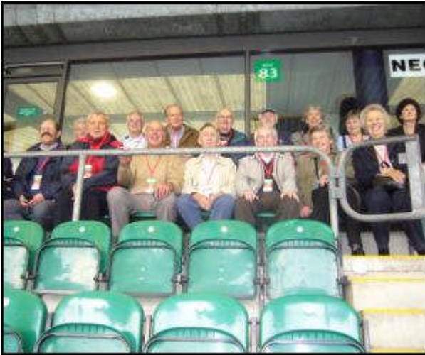
On high, looking down on everyone