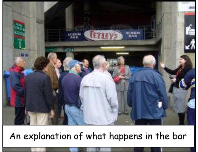
An explanation of what happens in the bar

Ask any true rugby supporter where the match-day day begins - they'll answer "in the pub". Ask the Sporting Forum study group where their visit to Twickenham began - you'll get exactly the same answer - in the pub!