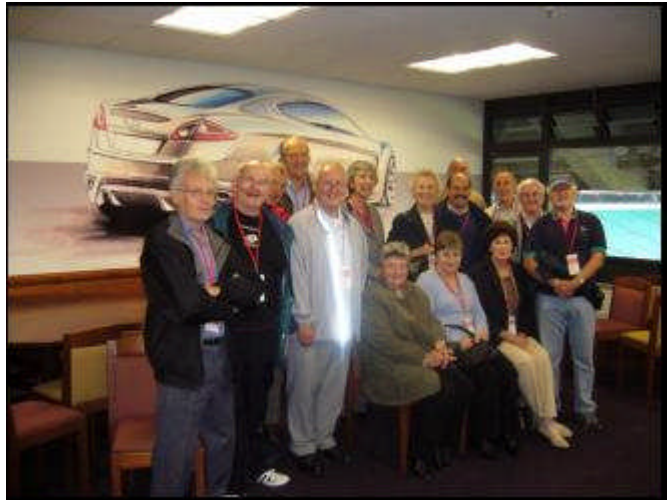
I doubt if we could af FORD this suite!

Our tour whisked us, by high speed lift, to the upper (3 rd ) tier and the Hospitality Suites located 35 metres above the pitch, add another 15 metres to the roof level and aircraft lifting off from nearby Heathrow seemed almost at eye level. These hospitality suites are all sponsored, and the names of many familiar businesses and institutions featured prominently.