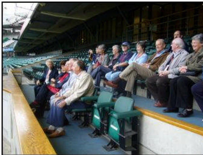
The Royal Box - who is in the seat?

Down a tier to the middle level and suddenly the décor of wall and flooring became rather more swish. Tastefully plastered walls, all finished in a neutral wash, replaced the painted breezeblocks. The pile of the carpet became thicker. The ambience in these areas was more akin to inside of 5* star hotel - and it didn't stop there. Steeped high in tradition the Presidents' room and the Council chamber had their walls covered with portraits of every President of the RFU since 1871. Three historic paintings depicting scenes from yesteryear gave a wonderful