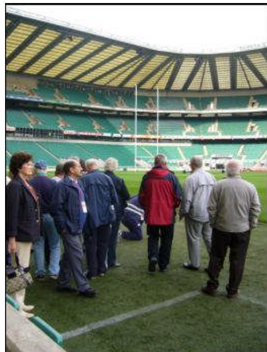
No! Look this way

One unwanted feature of many town and city centres, and also sports stadiums is pigeons, and the associate deposits they leave. No such problem at Twickenham - a Sparrow hawk is under contact, and the evidence (or lack of it) proves a job well done.